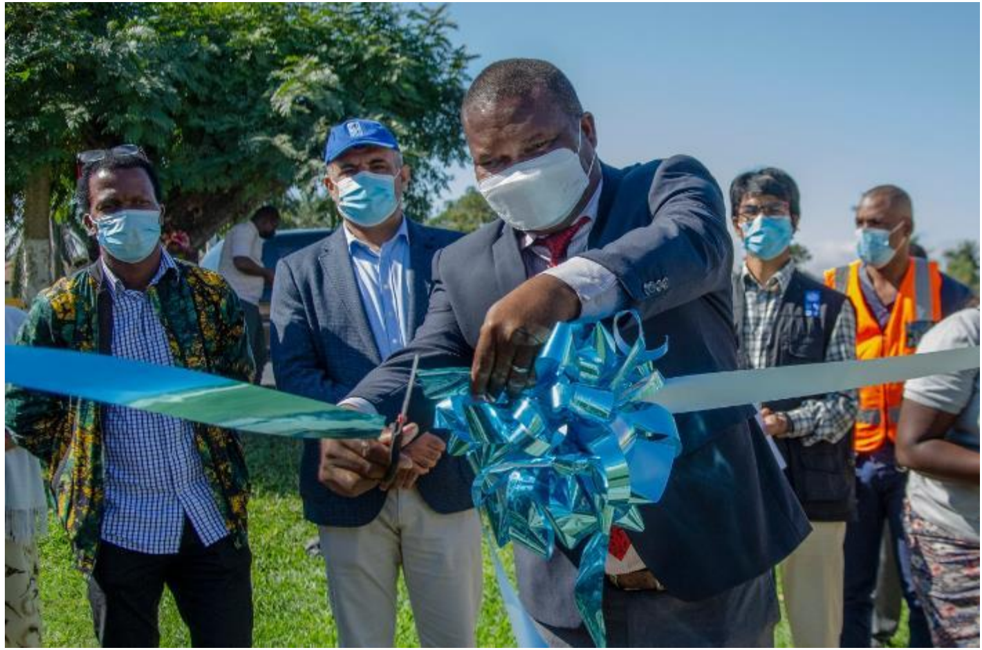
Library reopening ceremony.

The president of the Municipal Council of Dondo, HE Manuel Virade Chaparica, stressed that "a profound rehabilitation of the public library was made; this is an important infrastructure for the students' learning. (...) We need percipient people for this library to last for a long time. I am assigning the Education Department to select the best employees that we have in the Municipality of Dondo so that they can fill this role carefully".