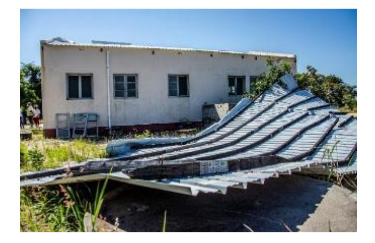
Chinamacondo Health Clinic to be rehabilitated, in September 2021. Damaged windows and roofing will be replaced using resilient techniques and resistant materials.

Sengo Health Clinic to be rehabilitated, in September 2021.