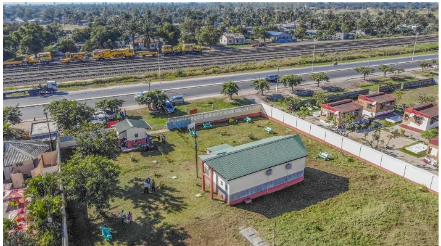
Dondo Municipal Library after rehabilitation.

UNDP Recovery Facility rehabilitated the Dondo Municipal Library following cyclone destruction, and modernized it technologically with new equipments.