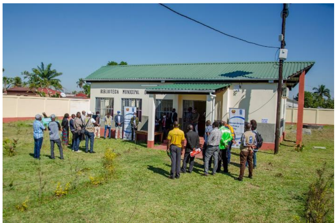
Dondo Municipal Library inaugurated.