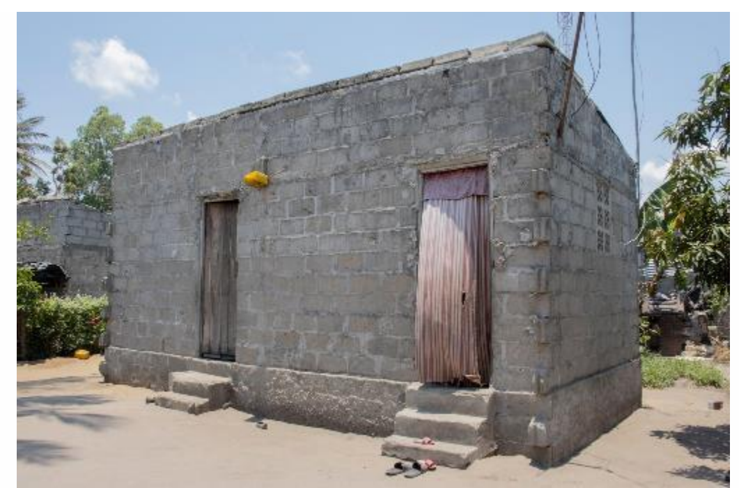
Amélia's house before the reconstruction. In addition to the damaged roof, the building had no windows and doors, which hampered the family's salubrity and safety.

In Mozambique, the impact of the Cyclone caused loss of life, widespread destruction of infrastructure and shelters, as well as the interruption of essential services, markets and livelihoods. The effects of the disaster were even more impactful due to the pre-existing vulnerabilities that characterize the most affected areas. Furthermore, Mozambique is one of the African countries most prone to climate-related disasters and is one of the ten countries in the world with the lowest Human Development Index (2020).