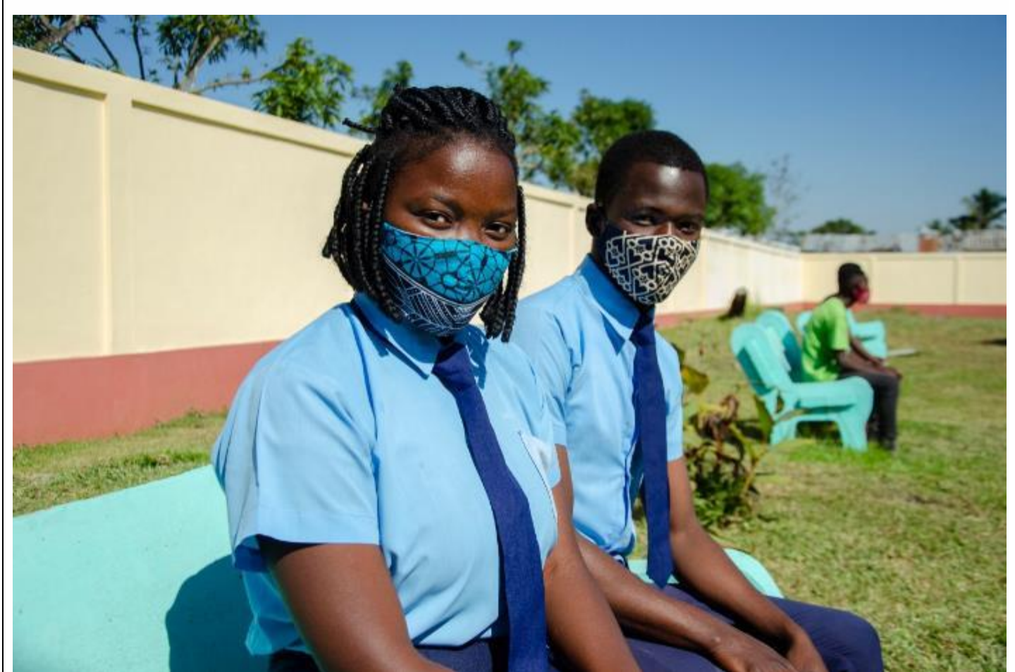
Students at the yard in Dondo Municipal Library.

created so that the child, the youths, the student can feel comfortable and learn all kinds of subjects. I believe that this library will bring many users not only from the city of Dondo, but also from Beira", he concluded.