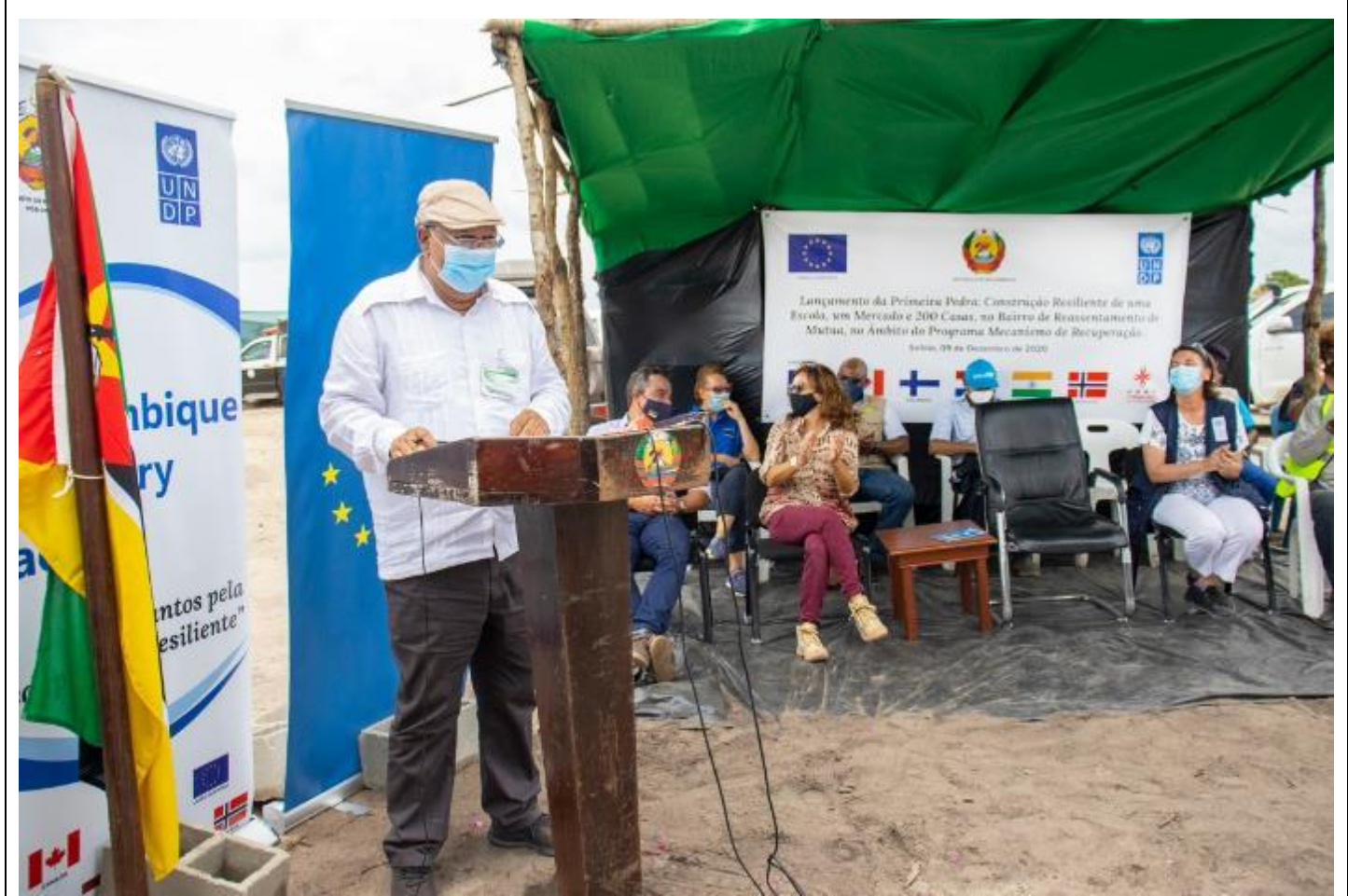
Provincial Governor announces the construction of 200 houses, a school and a market through the EU-UNDP recovery project in Sofala.

Published on 10 December 2020 at https://www.mz.undp.org/content/mozambique/en/h ome/presscenter/pressreleases/EU_UNDP_visit_p ost_cyclone_resilience_recovery_activities.html