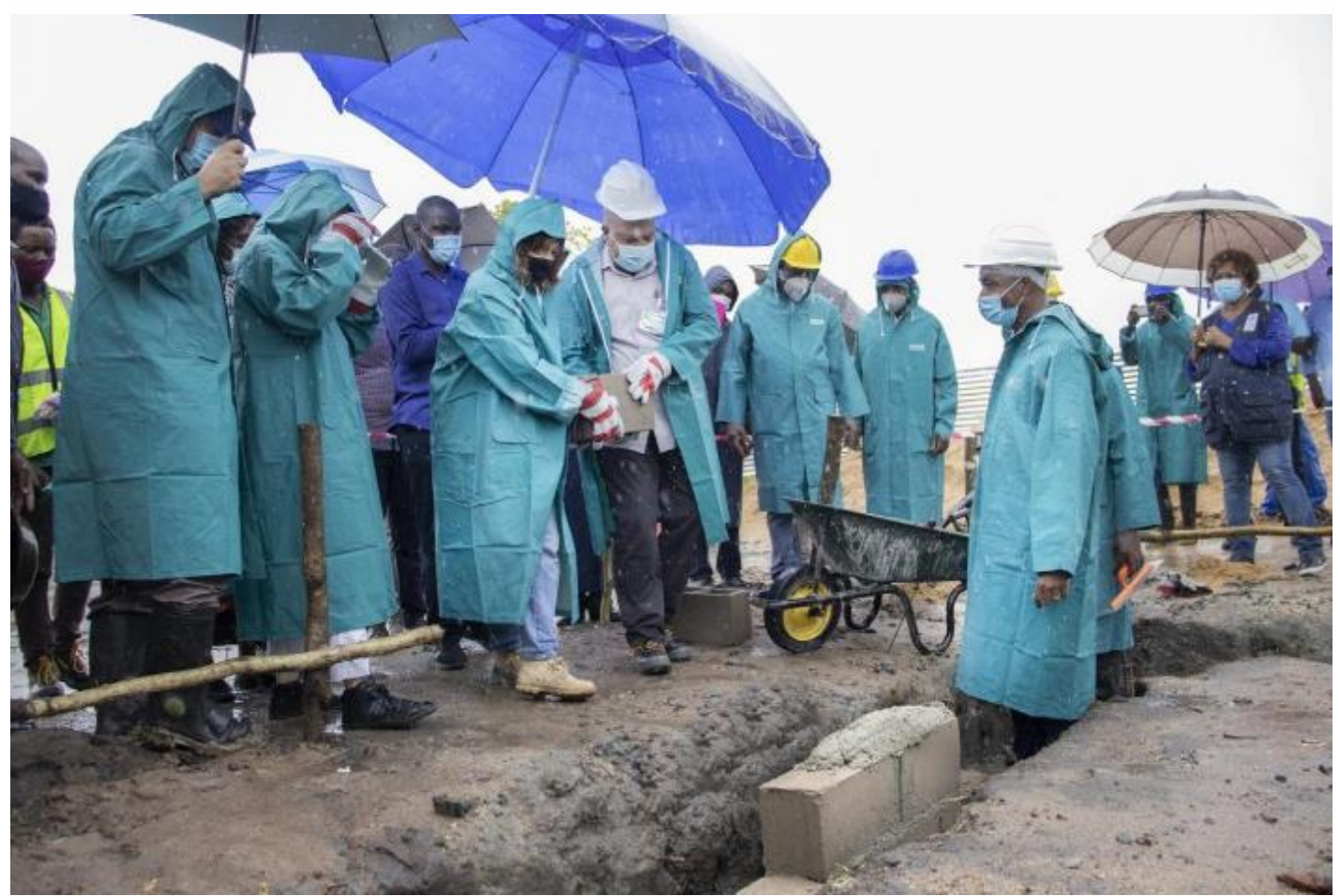
The EU, the Government of Sofala and UNDP held the first stone ceremony of the Guara Guara Market, Buzi District - the first of its kind in the resettlement neighborhood - directly benefiting 1,100 people through the UNDP Recovery Facility to help restore the economic services after the 2019 cyclone and floods.

withstand the multiple shocks, in a time when cooperation for development, such as this one between UNDP and the European Union, has become even more necessary".