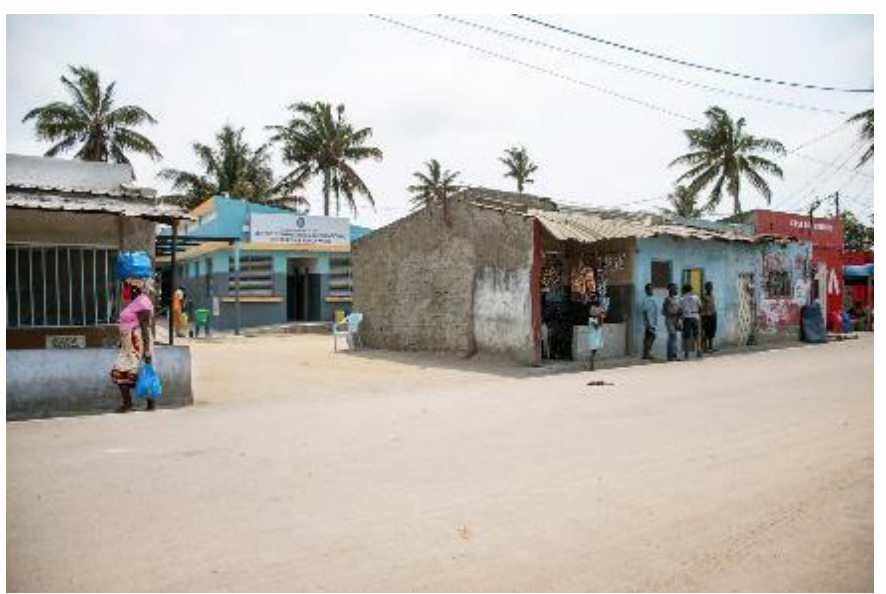
Main access street to the Community Center in Munhava.

In 2016, he was hired as a technician by Beira Municipality to manage the production of the new Multifunctional Community Centre for Renewable Energy in Munhava neighbourhood, the first of its kind in Mozambique, where he has been working ever since.