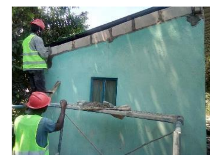
Preparation of beam for a house rehabilitation, in Mandruzi, in September 2021.

House under rehabilitation in Mandruzi, in September 2021.