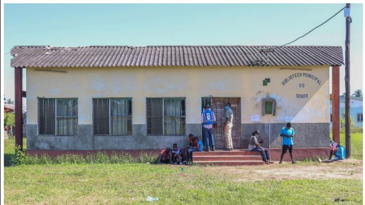
In 2020, before the start of the reconstruction and already during COVID-19 pandemic, the building was inoperative. Still, students flocked outside the premises to use the free Wi-Fi internet service.

"COVID-19 brought us a new challenge. A large number of students began to stay outside the closed library, to browse the internet that is installed and which, in a way, helped them to continue their studies from the online classes they were submitted to, as they were unable to afford it at home. In this sense, the library plays a decisive role in the culture and learning of these individuals. It is an added value now that the conditions were also created to comply with the sanitary protocol to tackle COVID-19. The revitalized garden is secured with fence walls and is a pleasant space outdoors, where they can sit and comply with the social distancing", concluded Bonde.